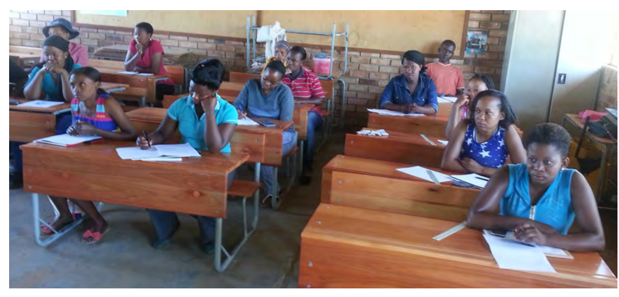
ABET classes in Tafelkop, Sekhukhune

In my engagements I found that the current realities in the villages were that the educators were not happy with their role in educating the youth. The educators work under very trying conditions; such as no resources, no governmental support and a lack of in-service training. The teaching curriculum that they used was outdated and in some cases they did not have the equipment for practical demonstrations, as such they were aware of the limitations of the learners graduating from their institutions.