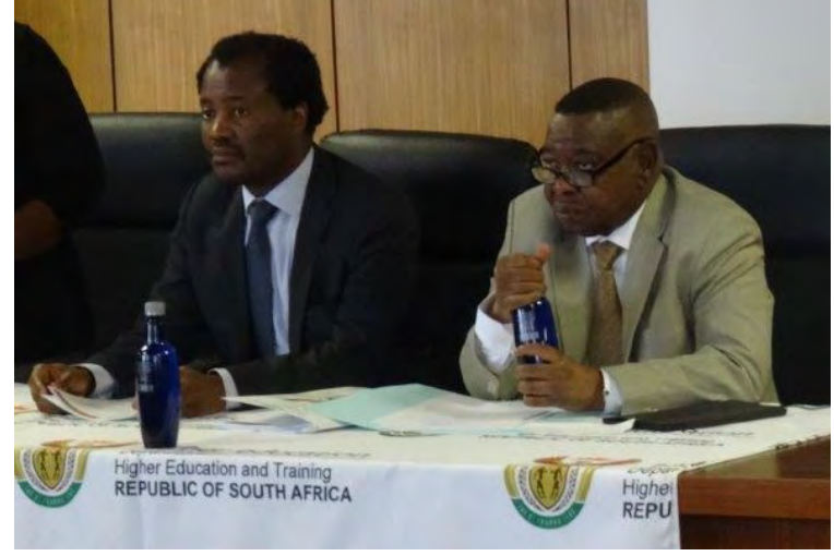
None of the youth, the researchers and other delegates had an opportunity to say anything to our Minister

In closing, we thank the Minister for coming and we hope that in the upcoming EPC conference we will have a conversation with him. We look