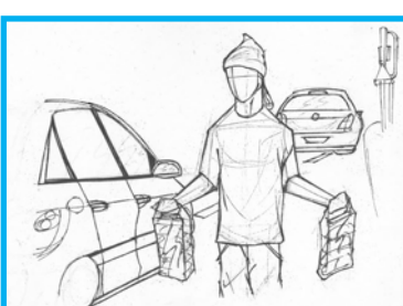
Traffic Light Vendor