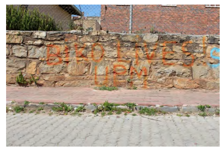
The UPM has challenged unemployment, poor-quality housing, lack of housing, lack of water and sanitation, lack of electricity and street lighting, violence against women and problems with the social security system

Press Statement by the Unemployed People's Movement