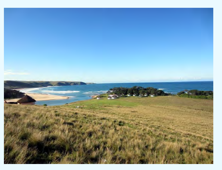
The Bulungula Incubator programmes include education health and nutrition, sustainable livelihoods and basic services.

In 2004, in Nqileni Village, Xhora Mouth Administrative Area (Wild Coast, Eastern Cape) an eco-friendly backpackers' lodge was opened. The lodge was partly community-owned and is now 100% community-owned. It is Fair Trade accredited, uses renewable energy, composting toilets and harvests sustainable rain and ground water sources.